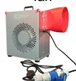
1.5HP Fan-check the fan