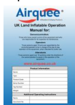
Land Operation Manual